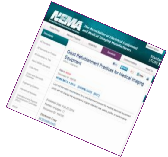
NEMA MITA 1-2015

In Aug. 2016, DITTA submitted to IEC (62B/1022/PAS) a draft specification on GRP to maximize utility and benefits to industry and regulators